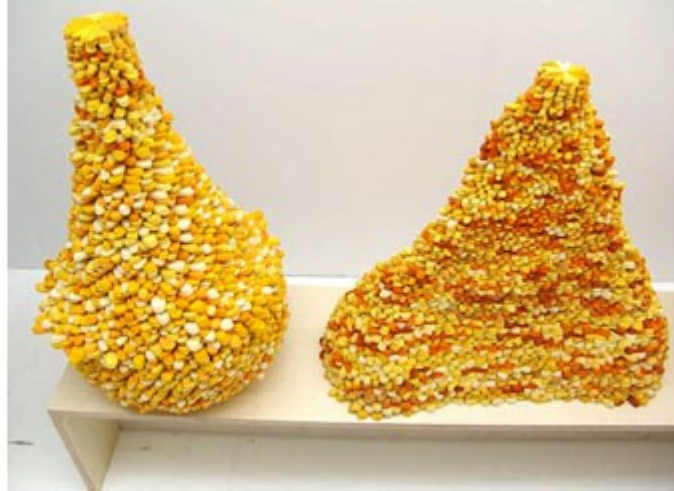
Art Basel Miami Beach - Anselm Reyle L & M Arts, NY (Untitled 2005)