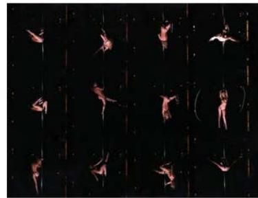
Philip-Lorca diCorcia, A control sheet from the Lady/G series , 2001, Courtesy of the artist and David Zwirner, New York