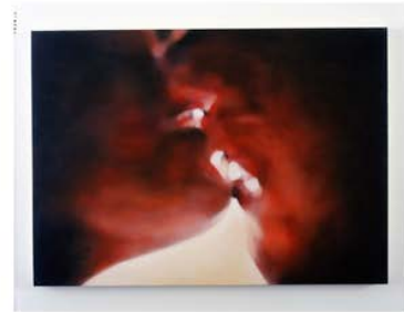
Judith Eisen, Face & Stone (3) , 2007, Oil on canvas, Courtesy of the artist and INPUT Journal/Vare Fine Arts