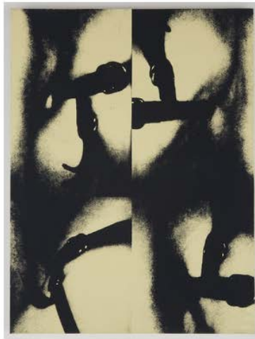
Genesis P-Orridge & Bria Hales, Untitled (from Candy Factory series) , 2001